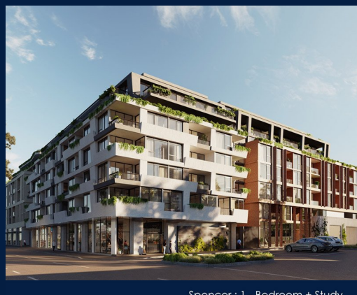
Spencer: 1 - Bedroom + Study