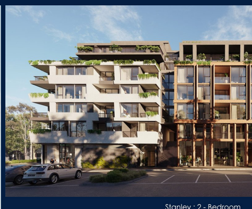
Stanley: 2 - Bedroom