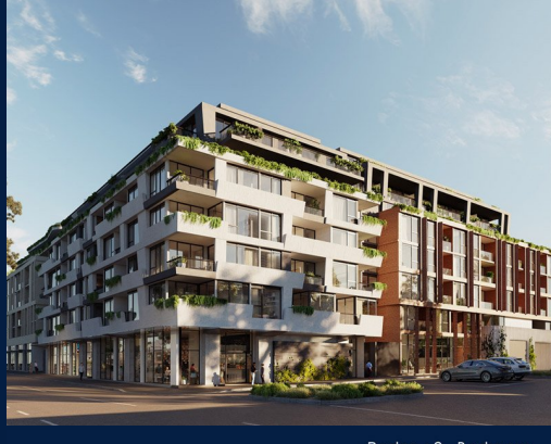
Roden: 2 - Bedroom